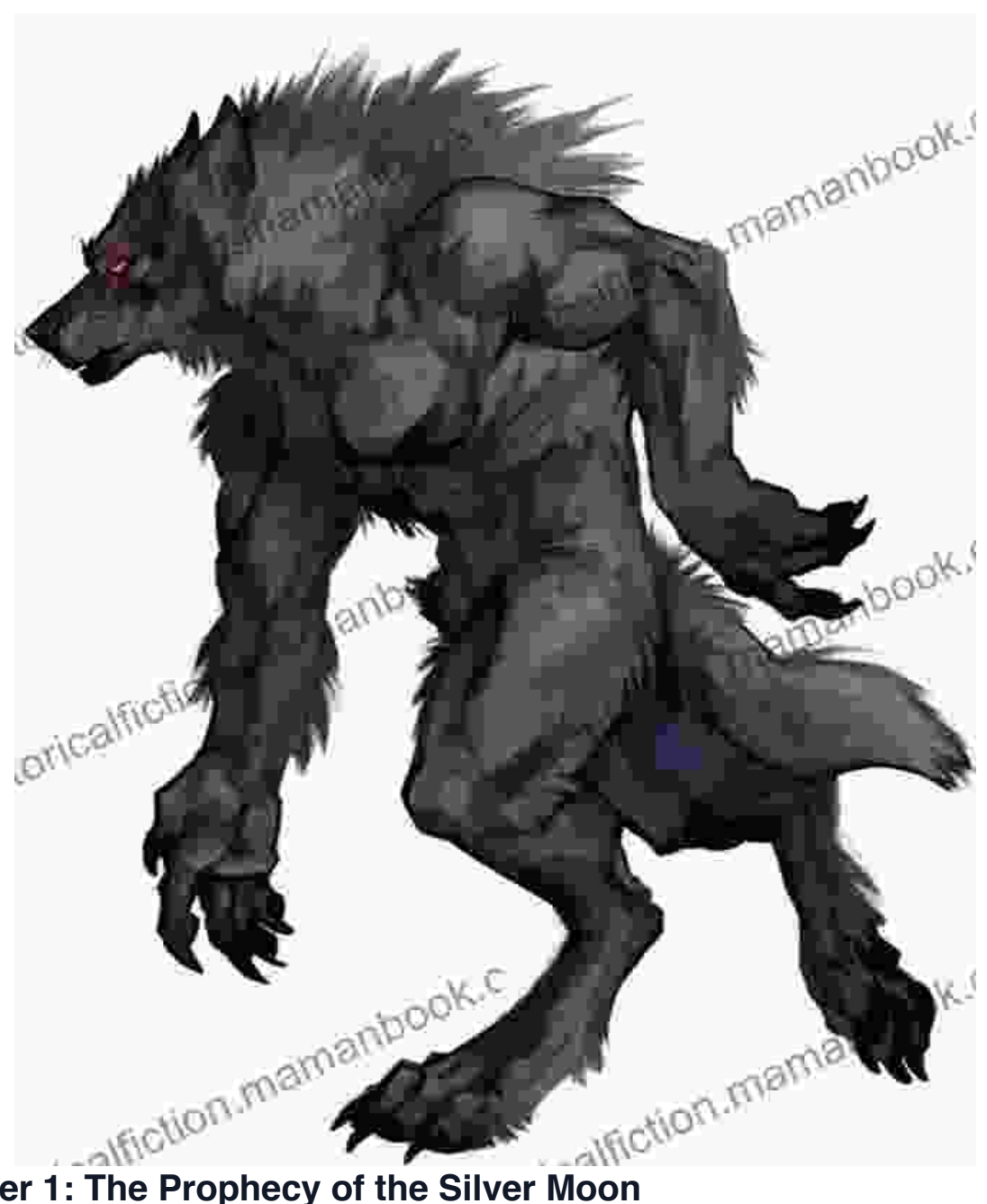
Chapter 1: The Prophecy of the Silver Moon

Lycan's mission was not one of mere conquest or bloodshed. He was guided by an ancient prophecy foretelling the rise of a formidable enemy that threatened the balance between the human and supernatural realms. The prophecy spoke of a warrior who would emerge as the Bane of Wolves, destined to unite the Dire Wolves against this impending doom.