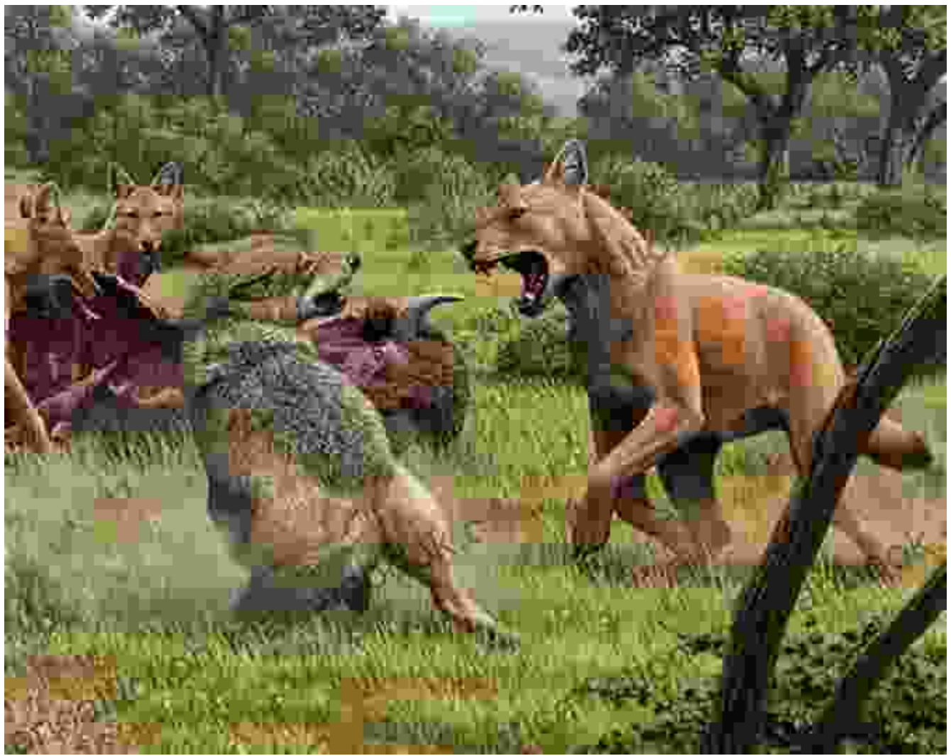
Chapter 5: The Aftermath

In the aftermath of the battle, London emerged victorious, but the scars of the conflict remained. Lycan and Anya, forever bonded by their shared experiences and unwavering love, led the Dire Wolves into a new era, where the bond between humans and supernatural beings grew stronger than ever before.